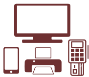
IT Asset Tracking