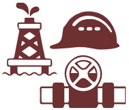
Oil, Gas and Mining