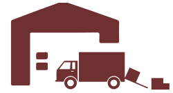
Logistic and Warehouse