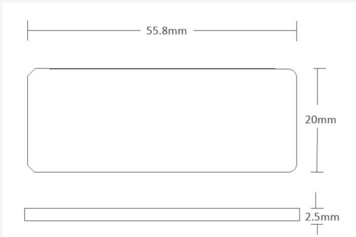
Measurements shown in mm